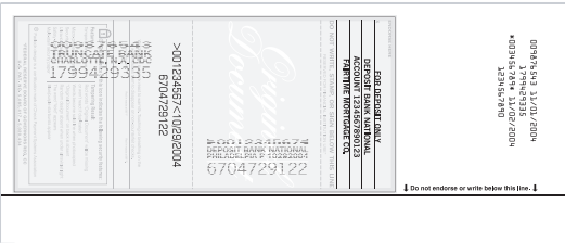
Back of a substitute check

Not all copies of a check are substitute checks. For example, pictures of multiple checks printed on a page (also known as an image statement) that is returned to you with your monthly statement are not substitute checks. Online check images and photocopies of original checks are not substitute checks either. You can use image statements and other copies of checks to verify that your bank has paid a check.